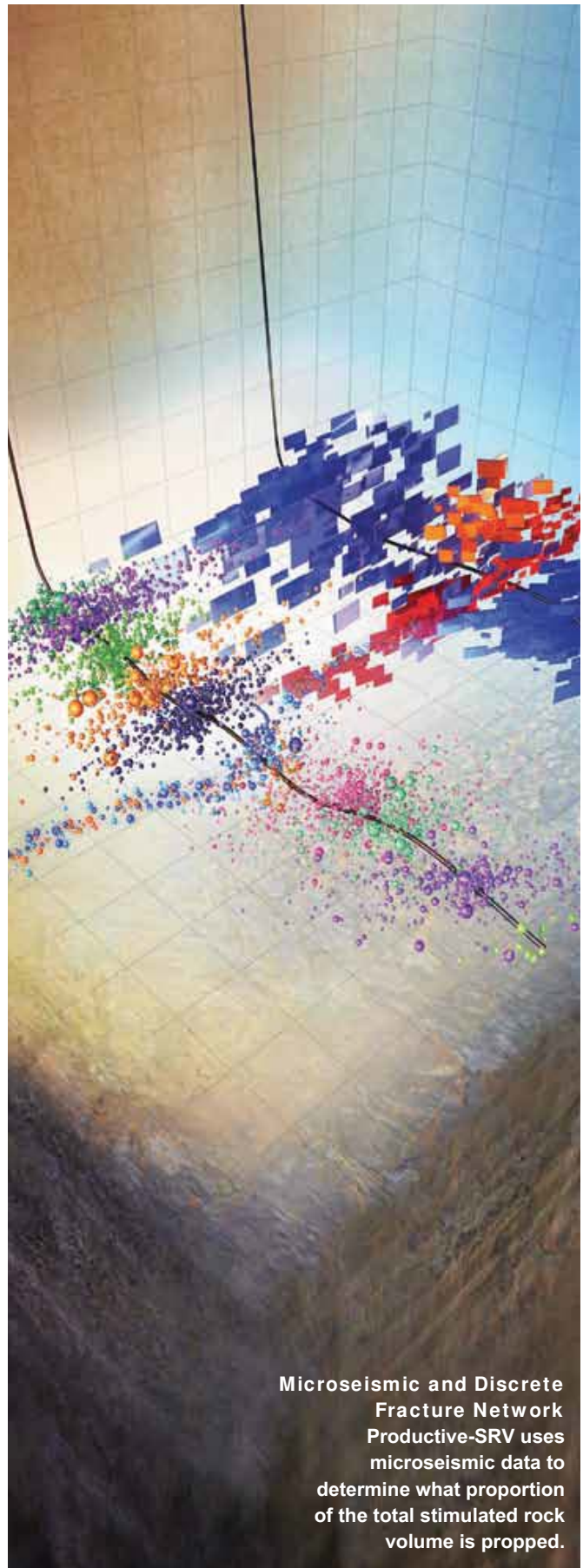
Microseismic and Discrete Fracture Network Productive-SRV uses microseismic data to determine what proportion of the total stimulated rock volume is propped.